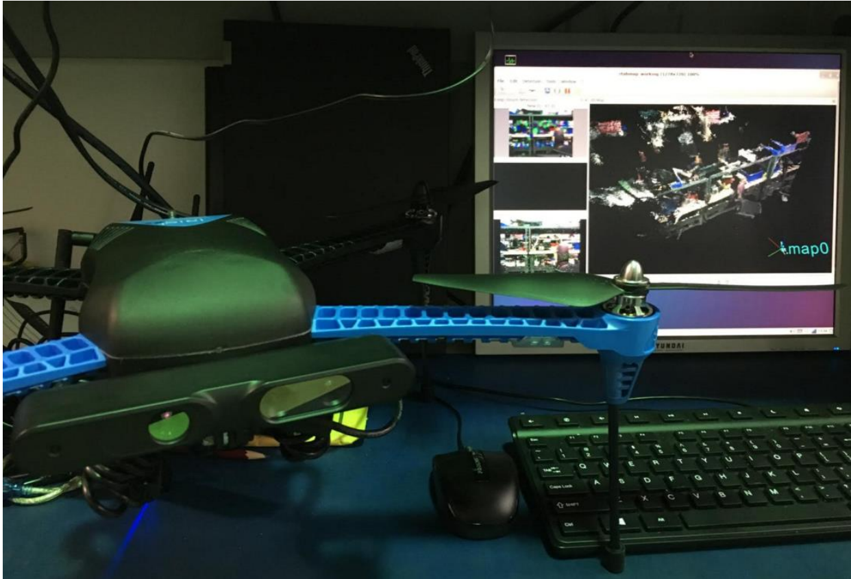
Figure 2: Iris+ Quadcopter and RGBD sensor with onboard SLAM system running

The map in the background of the quadcopter in Figure 2 exceeds the field of view of the sensor, and consists from several stitched sections of depth and color data. With default settings the RTAB-Map system is able to perform 6-DOF odometry as well as loop closure at a rate of approximately 1-3 HZ. Further tuning (including shifting from VGA to QVGA and reducing the rate of loop-closure detection) should enable odometry at 2-4 times this speed, meeting our requirements for mapping during conservative flight of the quadcopter.